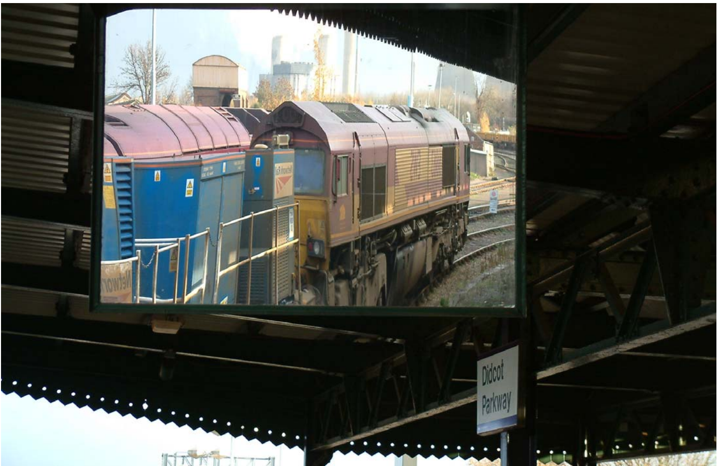
66163 on water treatment train 'reflecting' between duties (with 66034 & FEAs 642019, 642021) Didcot Parkway, 26 November 2006

47145 and 47832 heading south through bushbury junction tonight at 1715 on a FM rail trial.