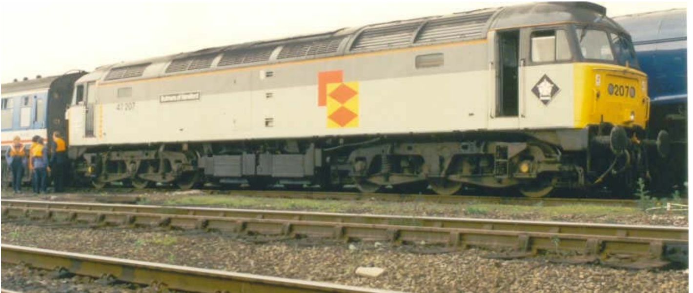
47207 in Railfreight Distribution Livery Coalville Open Day, 5 June 1988