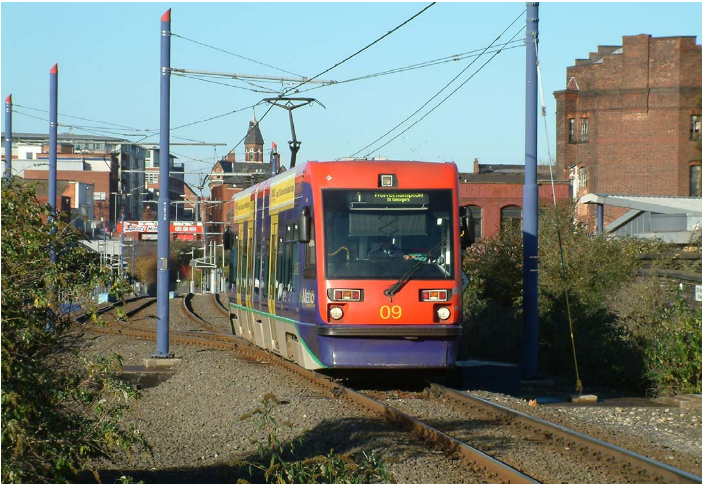
Midland Metro No.9 approaching Birmingham Snow Hill, 28 November 2006

Edinburgh: Although there is still a lot of money to find, building work has begun on the tram system in Edinburgh and it is hoped to have the first tram running by 2010.