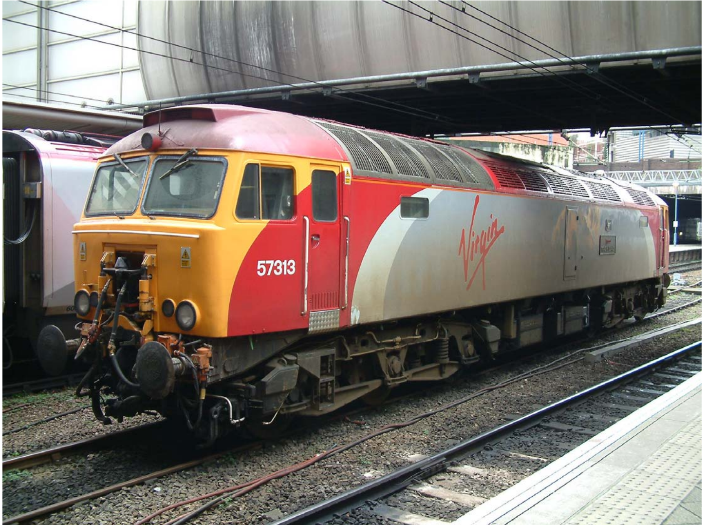
'Thunderbird' 57313 Tracy Island Birmingham New Street, 29 November 2006