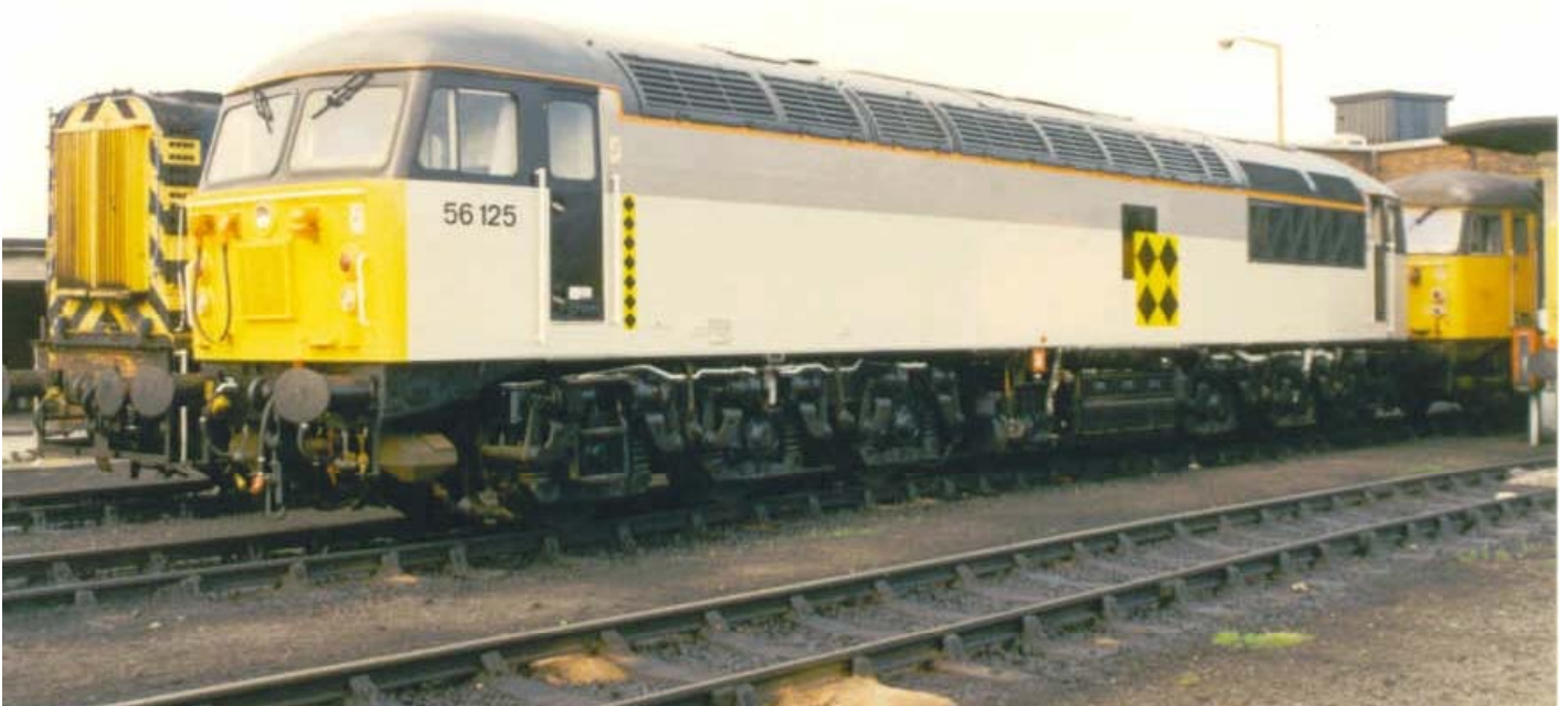
56125 in Railfreight Coal sector livery Thornaby TMD, 5 June 1988