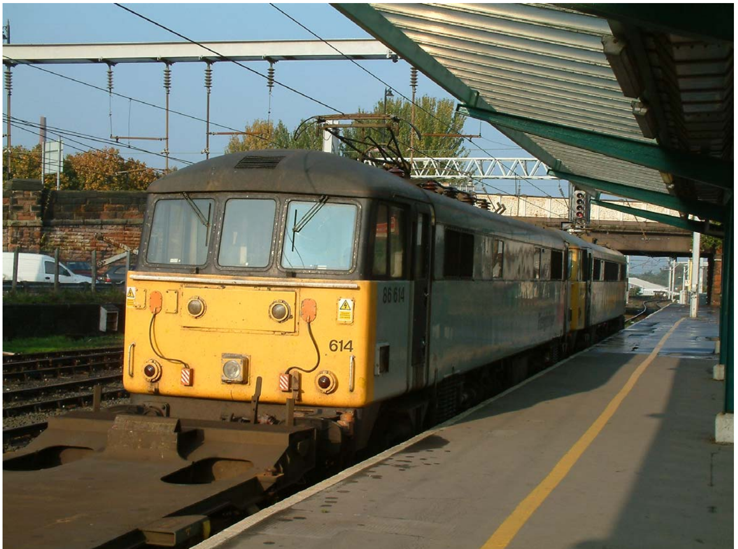
Freightliner pairing of 86614 + 86604 Carlisle, 17 October 2006

60076 6V07 60043 6E39 60007 6M42 60029 6Z67 60097 6E30