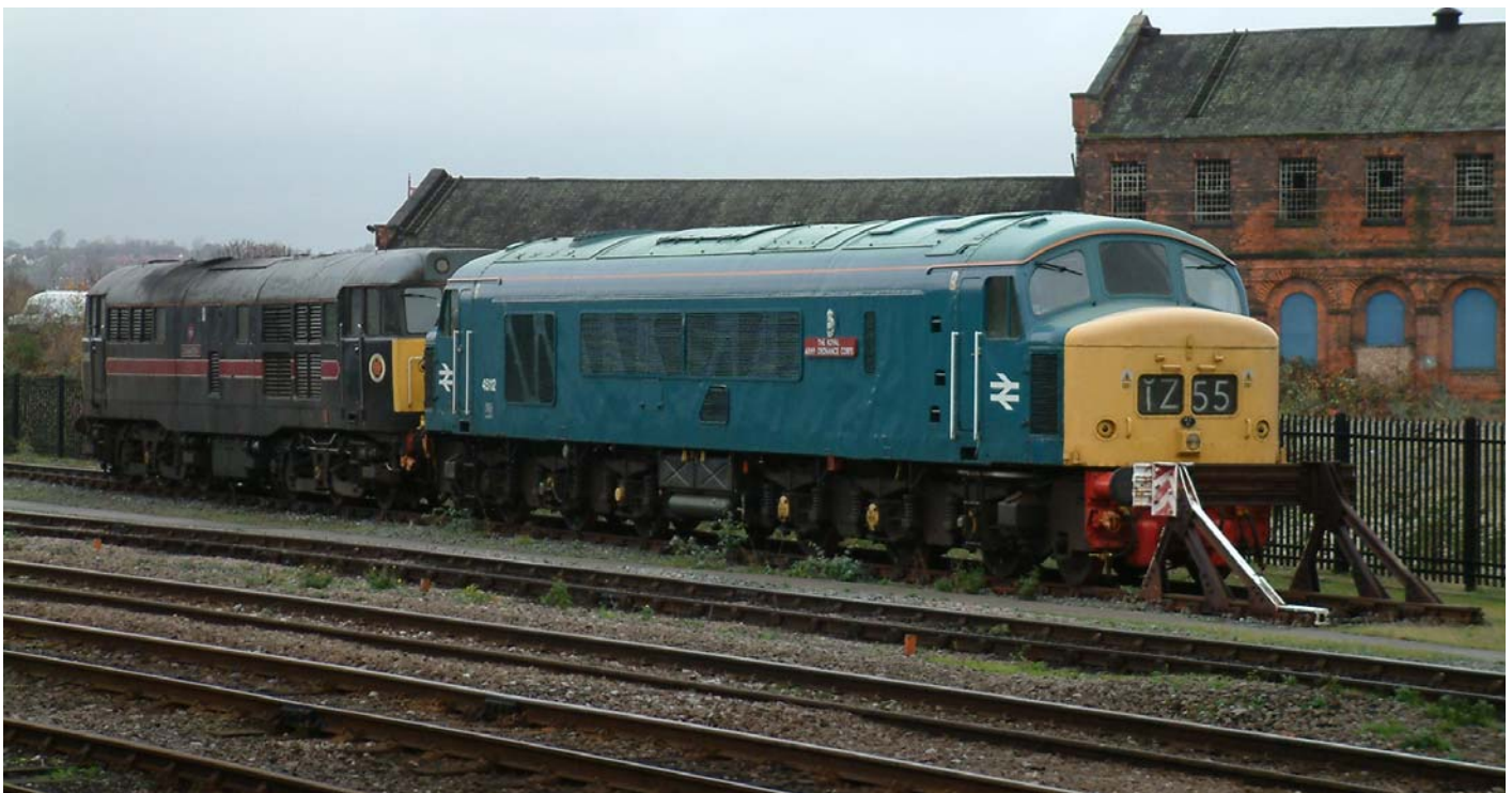
45112 Royal Army Ordnance Corps & 31602 Chimaera Derby, 1 December 2006