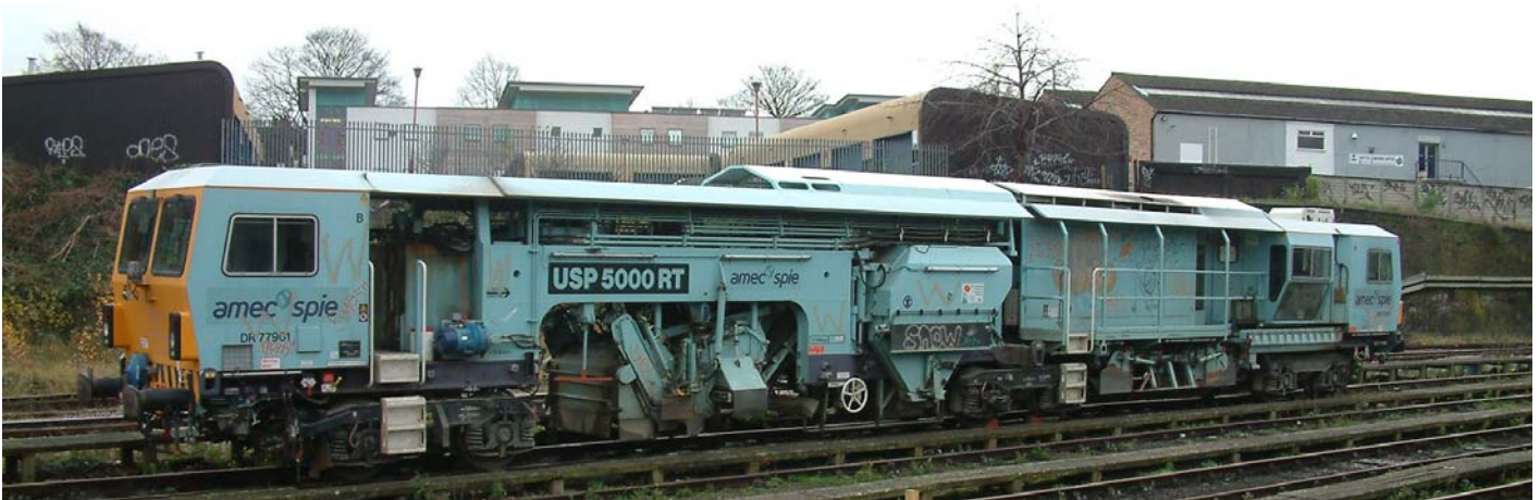
DR77901, Plasser & Theurer USP 5000RT Ballast Regulator (covered in graffiti) Leicester, 1 December 2006

The covered van is a basic merchandise wagon which became popular with British Railways when they began to move bulk, perishable products like meat, fish and fruit around the country. The high labour costs of sheeting over open merchandise wagons made the covered van a more viable option. They were also used for special purposes like live animals which were transported to markets and slaughter houses and conveying dangerous materials like gunpowder. The general purpose van was a 12t vehicle having a 17ft 6in underframe with a 10ft wheelbase, and the majority were fitted with automatic vacuum brake. The universal features of these vans were that they all had pressed steel ends, wooden body sides and hinged doors. By the end of their demise there had been some 37,000 vehicles made in the number range B750000-B787479 although now the only ones left are in internal use or preserved at most of the railway centres around the country.